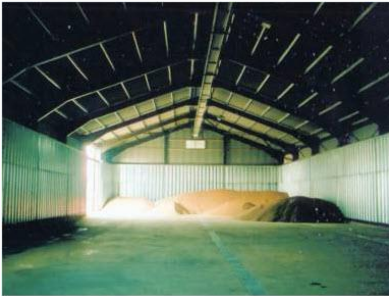
Fig. 30.2 Infested gunnies, go down and stock

In case sound stocks are brought to a godown where infested stocks are in storage, cross infestation takes place